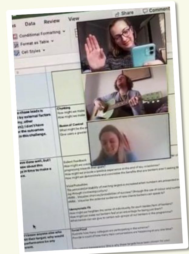
Keep the brain fresh and learn something new!