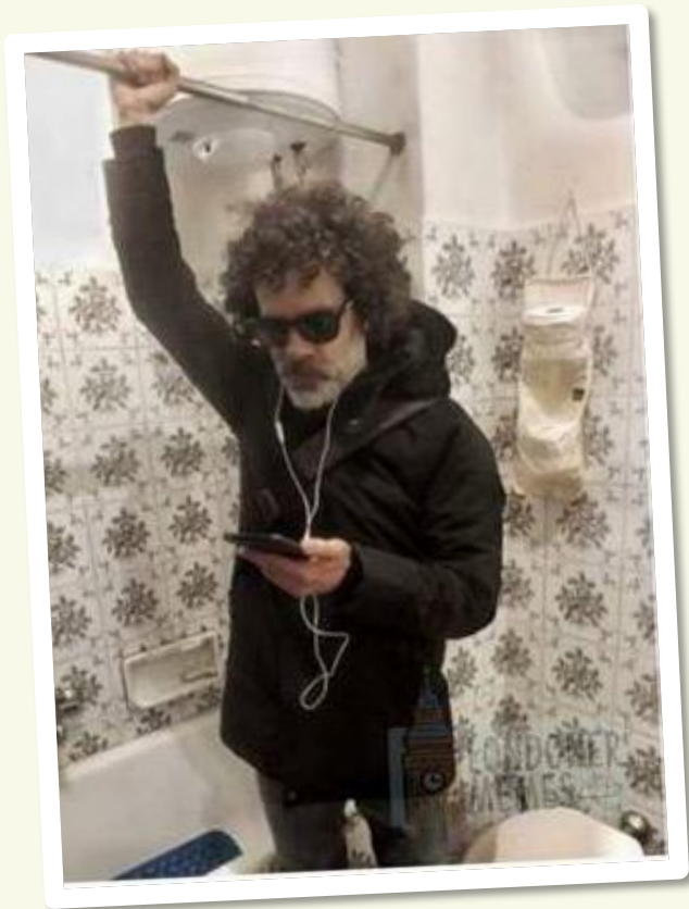
Where you can, do your best to maintain existing routines.