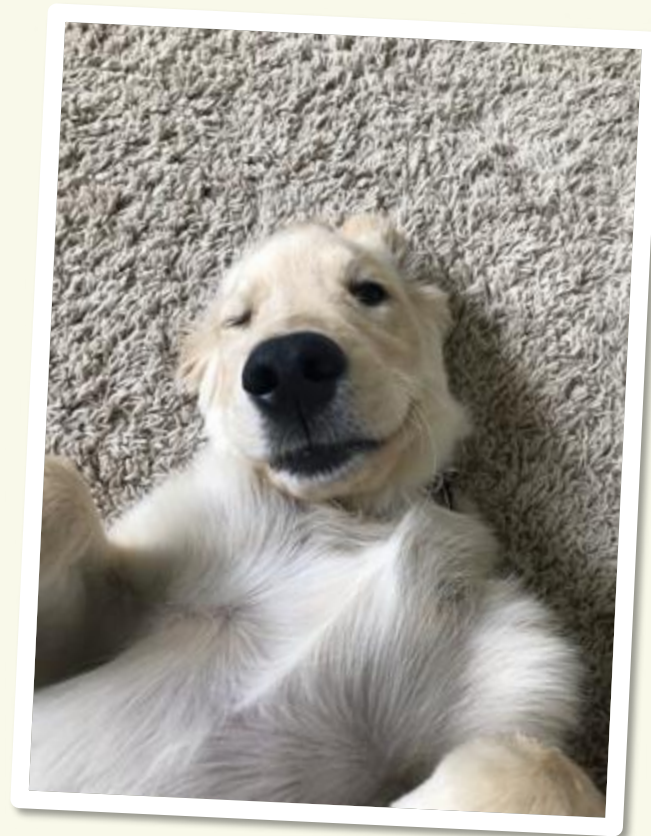
Animals generally boost our mental health.